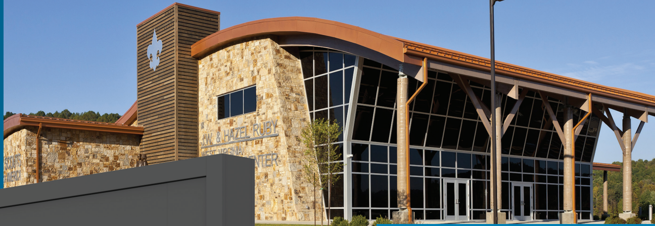
JW & Hazel Ruby West Welcome Center - Mount Hope, WV