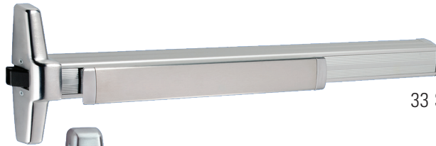
33 Series Exit Device

These top quality custom hardware exit devices from Von Duprin® are perfectly suited for all applications that require emergency egress. They are ANSI Grade 1, carry the UL label and approved for Life Safety. Both the rim and concealed rod devices feature single point dogging and are available with electric actuation.