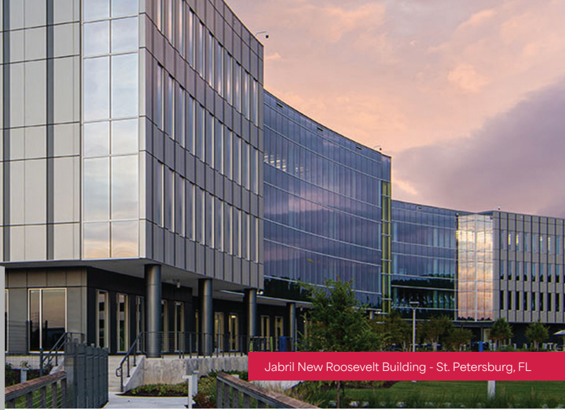
Jabril New Roosevelt Building - St. Petersburg, FL