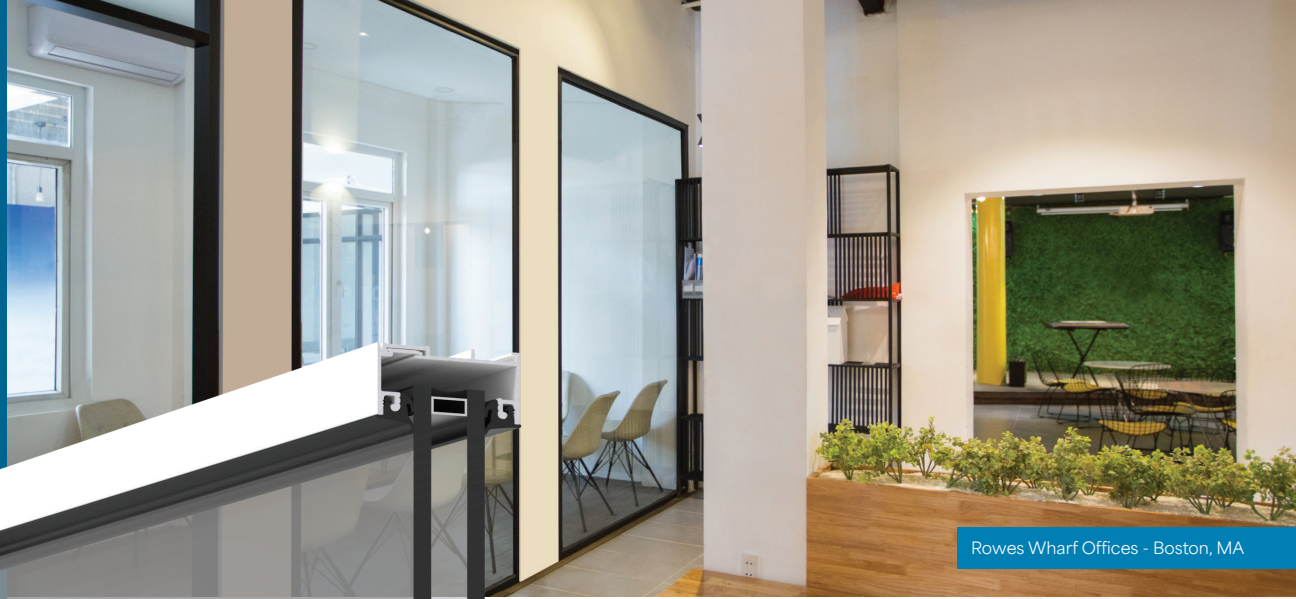
Rowes Wharf Offices - Boston, MA